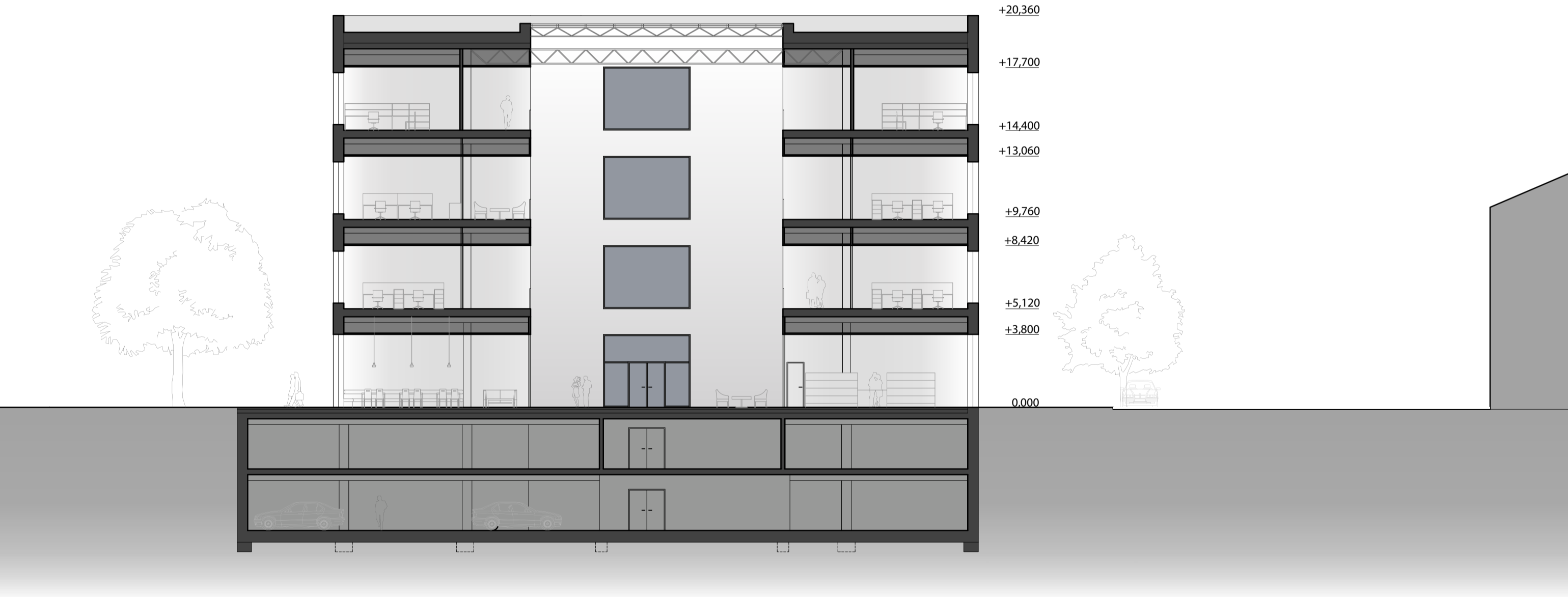
REZ B - B'